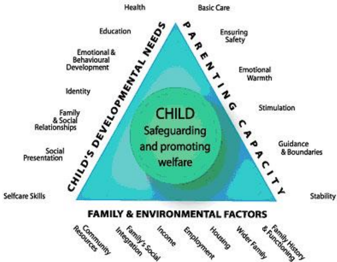
Figure 1 – The Assessment Framework 50